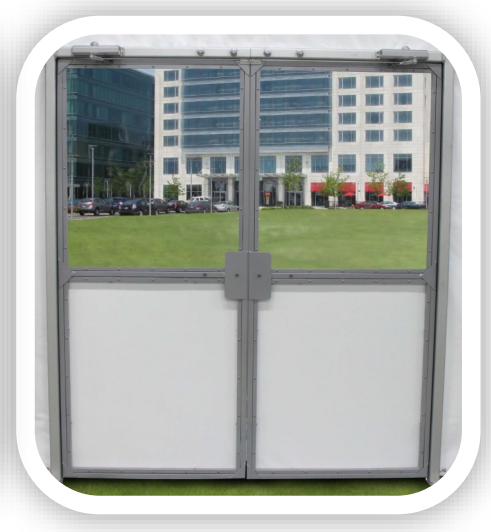
Commodoor inside view